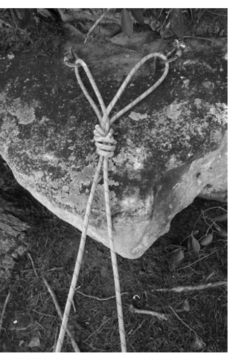
Double figure eight in use on 250-foot rappel in Little River Canyon, Alabama, USA

With these criteria in mind, let's examine the double figure eight knot used as a two-point anchor, and then we will look at some of its complex variations.