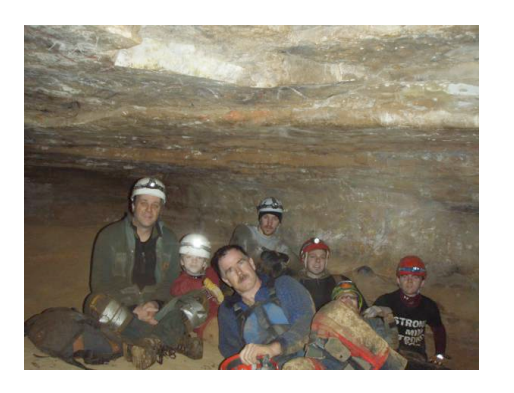
Buckner Cave Clean (!) T-Room