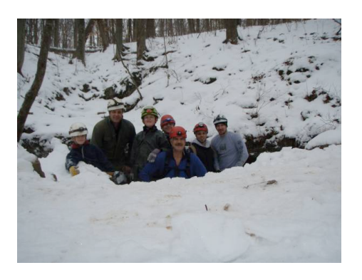
Buckner Cave Entrance December 2010