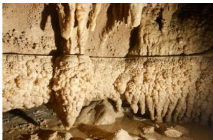
Formations in Sullivan Cave

Went caving? Let us know and send in a short trip report!!!