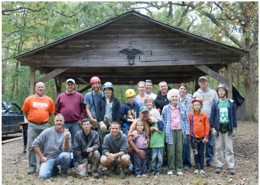
Picnickers at the 2010 Near Normal Grotto Annual Picnic at Clark Falls Farm