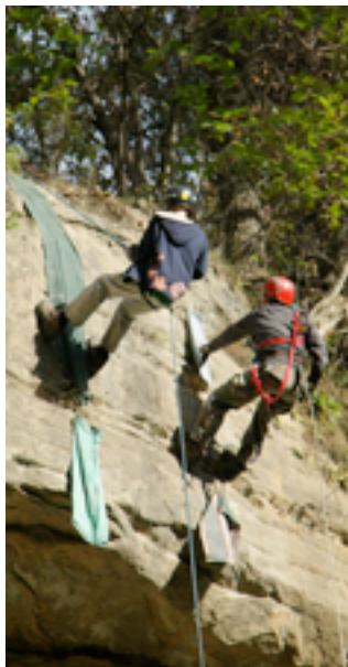
At the 2010 picnic

The NEW meeting area is in the Heart Center Classroom in Bromenn Center – check the website for directions!