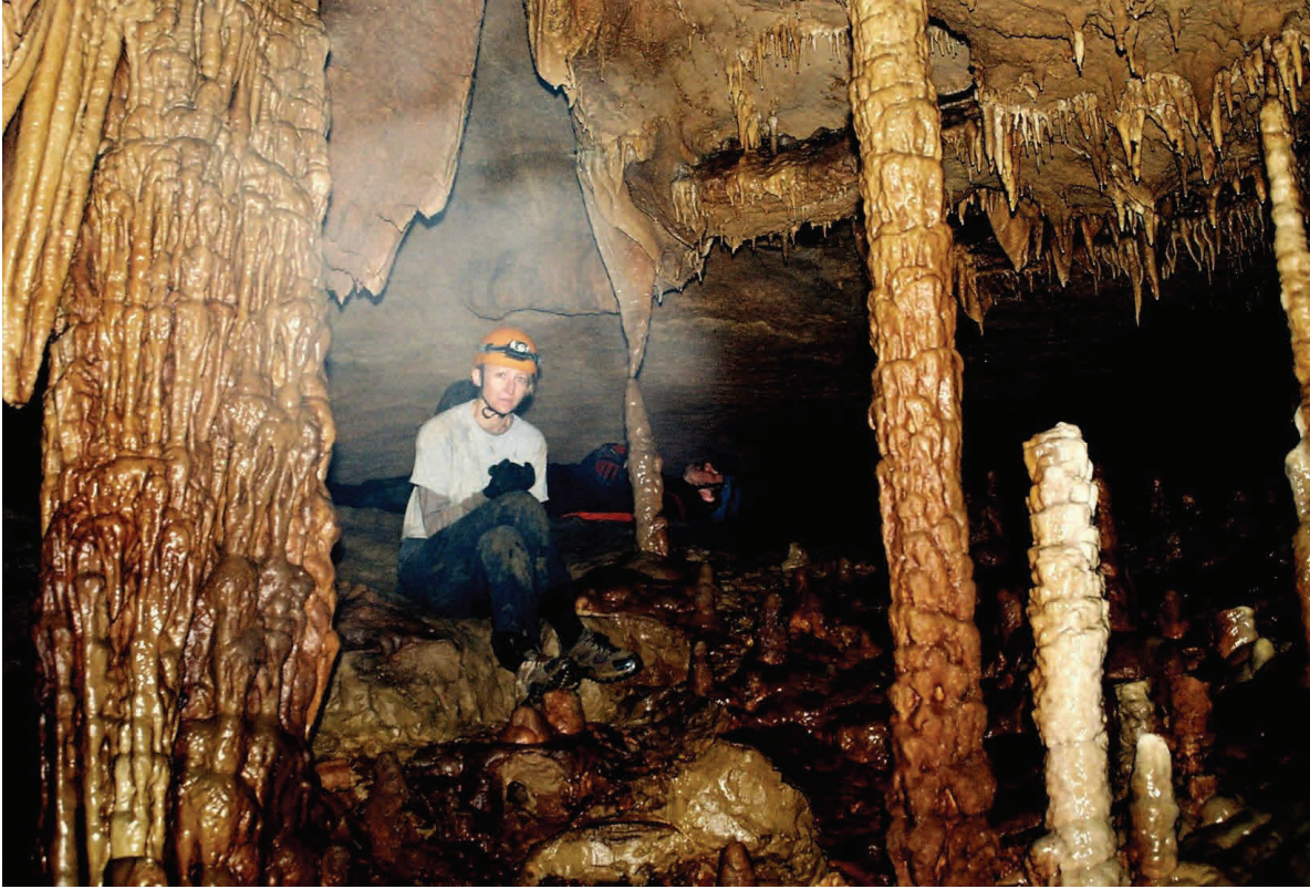
My One Shot Wonder (wonder where the film is ?)