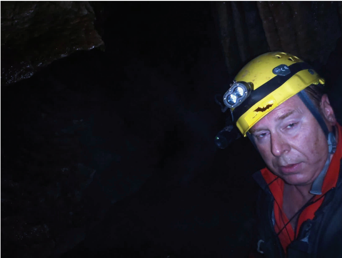
Here I am suc- cumbing to the dreaded HCHT syndrome (Helmet cam Head Tilt Syn- drome) Usually combat- ed with football shoulder pads or a neck brace.