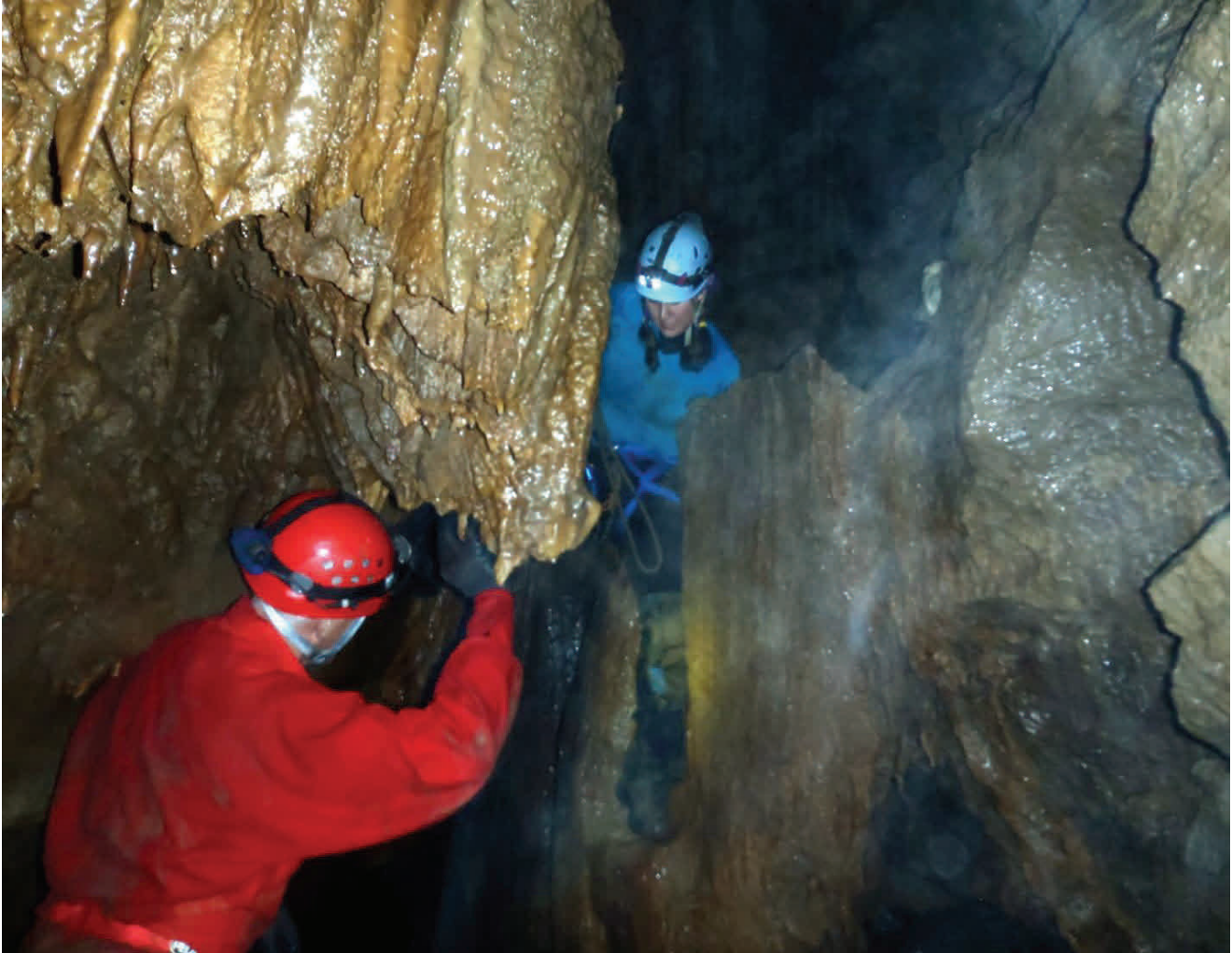
The Controversial Climb Down

I smugly deployed my tripod and rigged up for a foray of exposures. Set the self timer arm the flash for all five bulbs and Kapow , my first capture with the Olympus OM-4t and my coveted Select-o-Flash, yes a film camera whipper snapper.