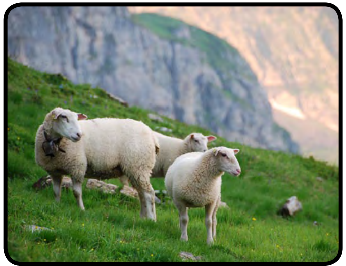
Pages 8 & 9, clockwise from below - a map of Jean-Bernard, currently fifth deepest in the world at -1602m after a long stretch as world's deepest, provided courtesy of G.S. Vulcain (zoom in to view detail); hiking a snowy pass in the fog on the way back to camp; camp was nestled in a grassy valley and surrounded by exposed limestone karren; sunset in the mountains over Samoëns; the view of the surrounding Alps from caver's camp; sheep on the grassy slopes of the mountain near camp.