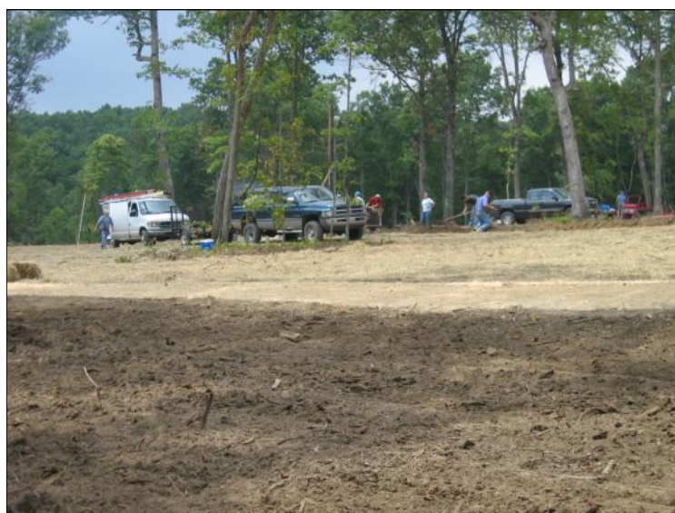
The Field, Before/after clearing, wood burning, and tanks the shower/hot-tub area